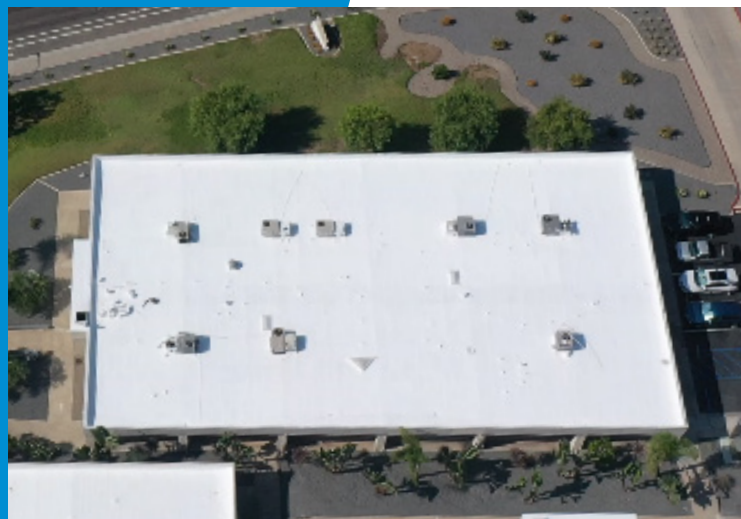
Encinitas, CA Properties - Ultra-Flex 1000 Acrylic Coating for Roof Restoration