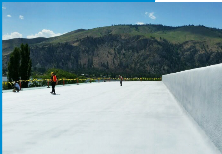
Auvil Fruit Company - Ultra-Thane 230 Spray Polyurethane Foam System Over Cold Storage